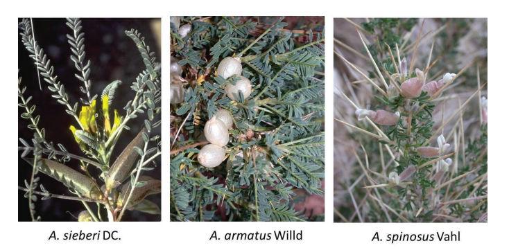
Figure 1: Picture of Astragalus species.

Phytochemical screening of the aqueous-methanolic extracts of Astragalus samples were carried out to test for the presence of