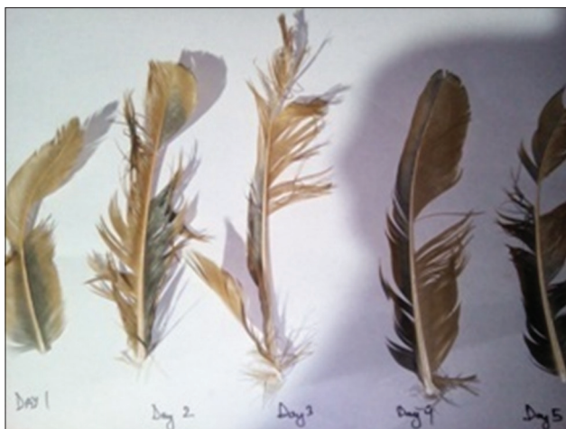
Figure 1: Feather degradation by keratinolytic microbiome on several days

soil with a relative activity of degradation was mostly Gram-positive and belongs to Bacillus . The multicellular eukaryotes like fungi may be present and needs certain morphological, biochemical analysis, and 18 srRNA sequencing for the exact identification.