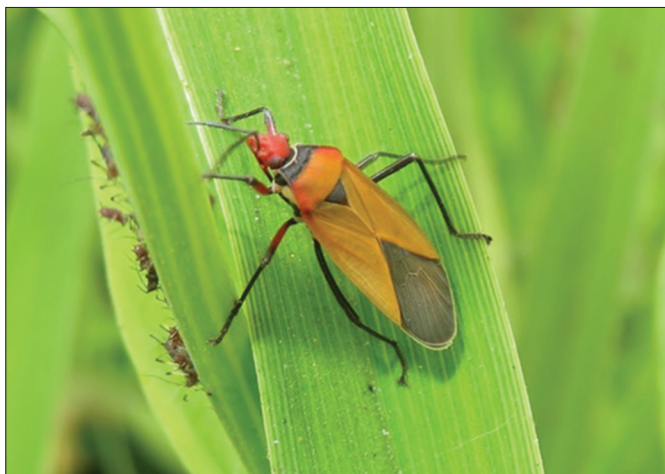
Figure 2: Dysdercus peruvianus adult.