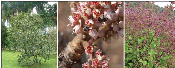
Figure 1: Example of plants with high activity essential oils against Dysdercus spp. From left to right: Pilocarpus spicatus (Source: Milton Groppo); Boswellia serrata (Dinesh Valke); Ocimum sanctum .

D. cingulatus is an important cotton pest in Pakistan and attacks other species of Malvaceae family. In a study conducted by Baloch (1990), it was described that the EO vapors from A. calamus , a national plant species, demonstrated low activity on the egg hatching (circa 15%) and moderate activity on adult emergence from eggs and nymphae (circa 50%), using the range dose between 2 and 4 \mu L, after 24 h of paper filter contact treatment. Moreover, the 1 \mu L dose caused circa 25% inhibition of adult emergence, whereas the 3 \mu L dose led to circa 33 and 43% inhibition for nymphaea and egg emergence, respectively [42].