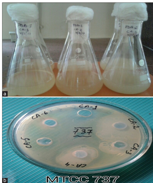
Figure 3: Broth culture and antimicrobial activity analysis of yeast endophytes; (a) Yeast endophytes cultured in Potato Dextrose Broth medium and (b) Antimicrobial activity of the crude metabolites against MTCC 737 ( Staphylococcus aureus ) by agar cup diffusion method.

-: Indicates no microbial activity, +: Indicates microbial activity; PDB: Potato Dextrose Broth, MTCC 424- P. aeruginosa ; MTCC 736- B. subtilis ; MTCC 737- S. aureus