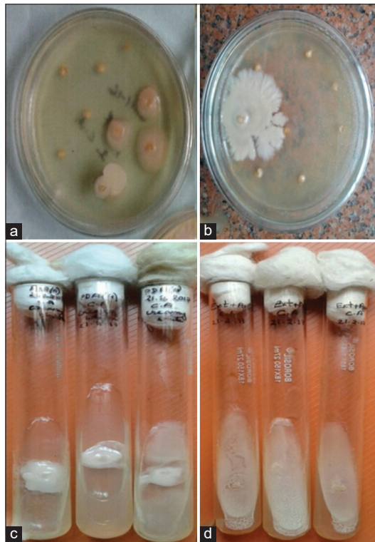
Figure 2: Isolation of endophytes; (a) Potato Dextrose Broth (PDB) medium; (b) Host Extract + Agar (HEA) media; (c and d) Pure culture of endophyte isolates; (c) PDB and (d) HEA media.

both the yeast endophyte and endophytic crude metabolites. The pathogenic Gram-positive bacteria include MTCC-736 ( Bacillus subtilis ), MTCC- 737 ( Staphylococcus aureus ) and the Gram-negative bacteria include MTCC- 424 ( Pseudomonas aeruginosa ). All the test organisms were procured from the Council of Scientific and Industrial Research- Institute of Microbial Technology (CSIR- IMTECH), Chandigarh, India. The bacterial strains were maintained on freshly prepared nutrient agar slants and stored at 4°C for further use.