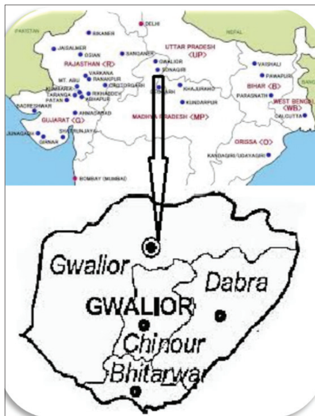
Figure 1: Gwalior and nearby regions.

Amaranthus viridis L. is possibly of Asian origin but now a cosmopolitan weed of tropics and subtropics of the world. This is an ascending, erect, annual, or short perennial herb of about 1 m length