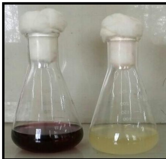
Fig. 1: Decolorization of Acid Maroon V dye by isolate SP4.

Various sample from Faze chemical effluent, Dye contaminated soil, and Sludge sample was used to isolate dye decolorizing microorganisms. A total of 15 bacterial strains were isolated and purified by subculturing on nutrient agar plates. The morphological and cultural characteristics of the bacterial isolate are shown in Table 1. All the isolated cultures were further screened for dye decolorization in liquid medium. The screening of all the isolate for dye decolorization is shown in Table 2. The result obtained shows that maximum decolorization (76.07%) of Acid Maroon V dye by bacterial isolate SP4 was obtained after 48 hours of decolorization process. Patel et al. , (2016) reported maximum decolorization (87.33%) of Red H8B dye by isolate R5 within 72 hours of incubation.