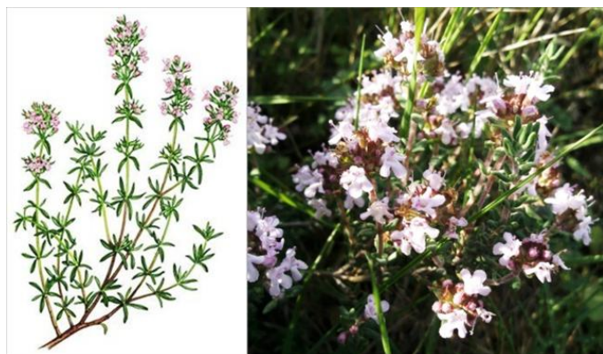
Fig. 1: Thymus vulgaris L [11].

Thyme is a tiny perennial shrub, with a semi evergreen ground cover that seldom grows quite to (40 cm) with horizontal and upright habits [10]. Figure 1. Shows the Thymus vulgaris L. [11]. The stems become woody with age. Thyme leaves are very little, usually 2.5 to 5 mm long and vary significantly in form and hair covering, depending on the variety, with every species having a rather completely different scent. T. vulgaris leaves are oval to rectangular in form and some what fleshy aerial components are used for volatile oil production, principally by steam distillation. The contemporary and dried herb market uses it for cooking [12].